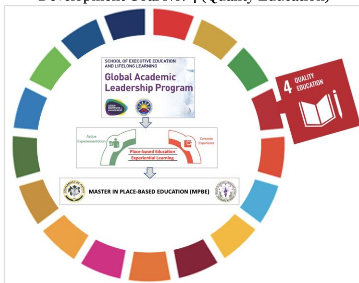
Figure 3. PBE-LE GALP-Teaching-Learning Model Aligned with the Achievement Of Sustainable Development Goal No. 4 (Quality Education)

IGPS applies Place-based Education with Experiential Learning as a teaching and learning model to motivate students to continue and enjoy their graduate studies through utilization and implementation of their own learning to the real-life experiences at the workplace.